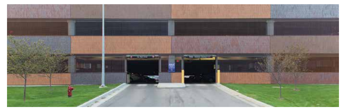
Normandale Community College, Bloomington MN.