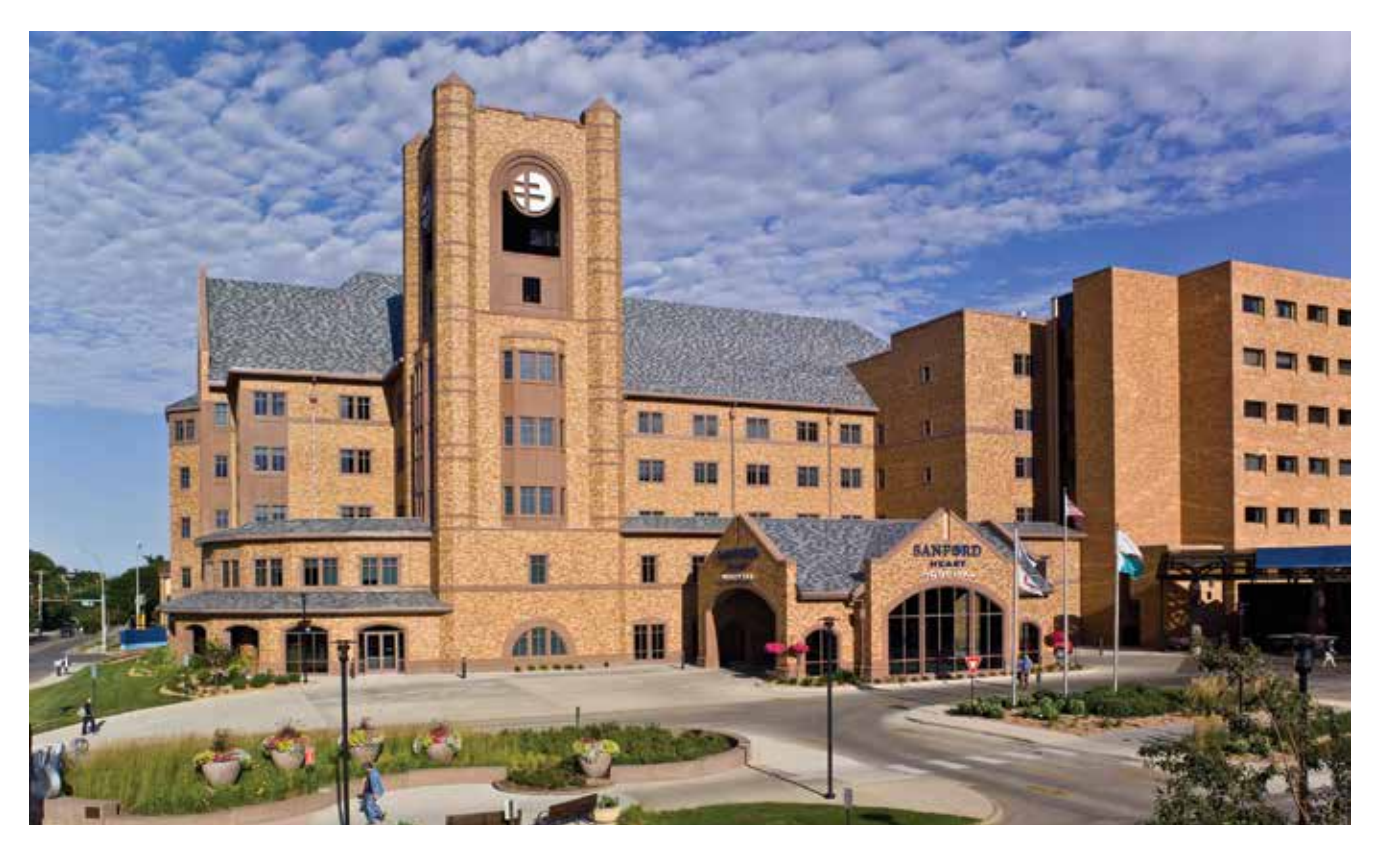
Sanford Medical Center, Sioux Falls SD.

The key to growing the use of precast in architectural applications is to identify business partners that offer a diverse product line, the capacity to supply any size job, and have a track record of successful engagement within the precast industry. For architectural precast utilizing embedded thin brick the clear choice is Endicott.