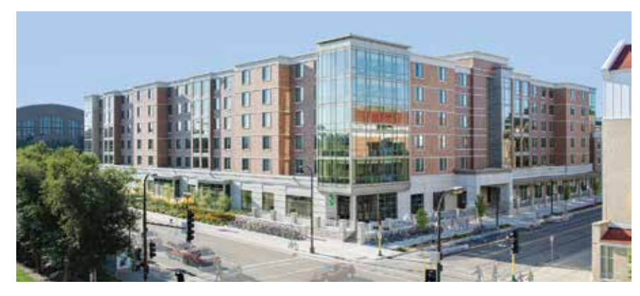
University of Minnesota 17th Avenue Residence Hall, Minneapolis MN.